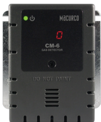
Grey Housing (Standard)