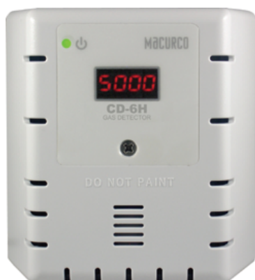
White Housing Option

The Macurco 6 & 12 Series fixed gas detectors provide life-saving solutions aimed to protect people and property. These fixed gas detectors are designed for low level detection, mitigation, and notification. Let these detectors do the work for you by shutting off valves, turning on fans, engaging horns and strobes, and provide notification to fire panels and building automation systems when gases reach key limits.